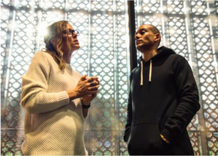
Quotations should stay in the Friend Zone.

sentence-by-sentence, so in order to use them, you don't have to understand the context of a quote or how it fits into the bigger picture. Try to avoid Paparazzi Syndrome—don't take things out of context. It can be all too tempting to find a quote that supports your point without understanding the context or including all sides. Here's Howard and Jamieson's details about quotation: