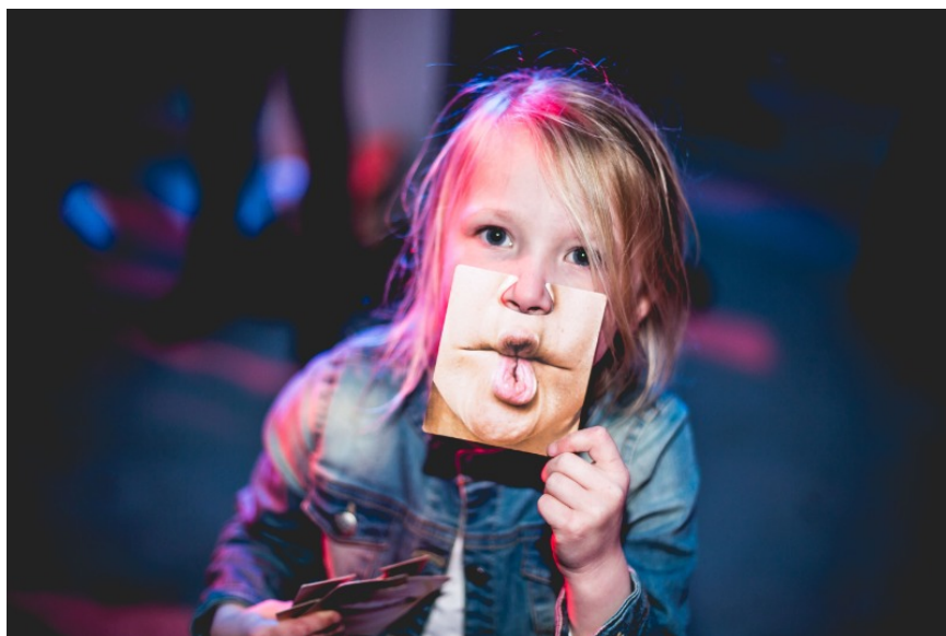
Plagiarism is like taking the words out of someone else's mouth.

So if you want to avoid the dangers of unintentional plagiarism, try not to work sentence-by-sentence and stick as much as you can to summary (oh, Summary, you're so beautiful!). But there are definitely times you'll need to paraphrase, so here's Howard and Jamieson's definition of paraphrase to make things more precise: