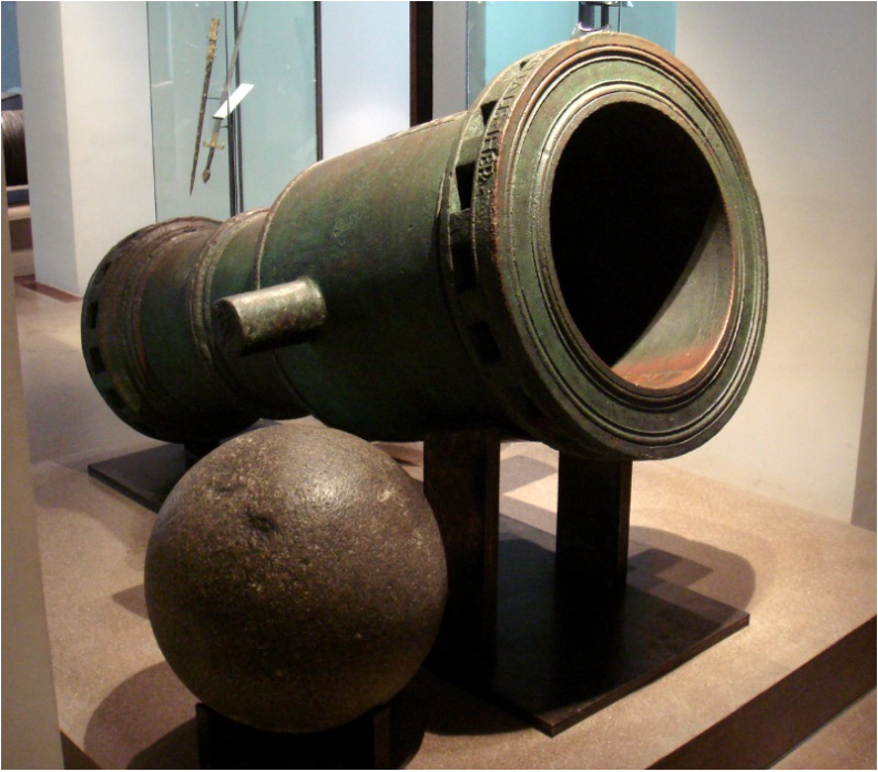
An original bombard—is this what being bombarded with information overload feels like?

We live in a world where we're constantly bombarded by information. We hold in our hands the ability to google any question we can think of and get thousands, if not millions, of answers. Thanks, Siri and Alexa!