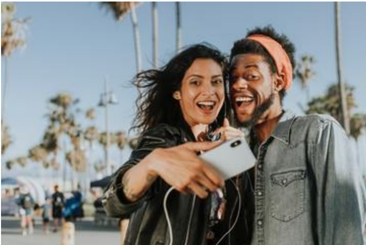
Paraphrase = Like! ( Public Domain )

Paraphrase is an acceptable form of citation and has a medium degree of difficulty. It's similar to summary because you're also translating information into your own words. This comes with the same advantages of being able to control the language of your sentences and match your own writing style. By using your own language, you can also point out what's most relevant to your paper, so that's good. And by putting it in your own words, you prove that you at least understand what's being said by the author(s) in that particular passage. However, the problem is that when you paraphrase, you only work with a short passage at a time (usually only a sentence or two). I know this might sound alarming, but for this reason, paraphrasing can actually be dangerous.