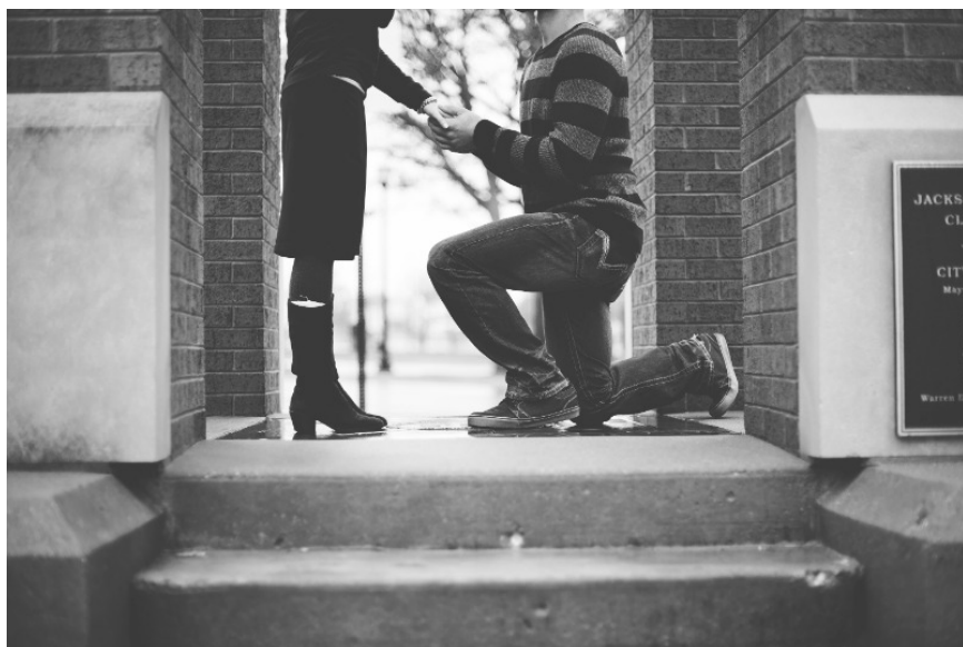
Summary = Love!

Summary is the most felicitous type of citation and the most sophisticated. The reason most students choose not to summarize when citing sources is that summary has the highest degree of difficulty of all the types of source citation—and for good reason: you have to actually understand your source in order to summarize it. You can quote anything you want to without ever understanding what it means, but in a summary, you not only translate the text into your own words, you also shorten its length and provide just the highlights. That means that you have to understand what the most important points are. That is definitely harder than just quoting all the time, but if you add more summary to your papers, they will also increase in sophistication and probably in grade as well.