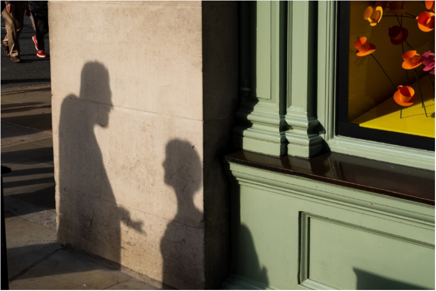
Go away, Patchwriting!

Patchwriting is so 6th Grade. The penguin paper I described above was really an instance of patchwriting. Patchwriting is where a writer—whether intentionally or unintentionally—takes a text, changes some words or substitutes synonyms or changes some grammar but doesn't change it enough to be considered their own words. The degree of difficulty is extremely low because you don't have to understand the text well or even quote well to do it. You can be sloppy. But beware: the consequences can be as dire as if you plagiarize outright.